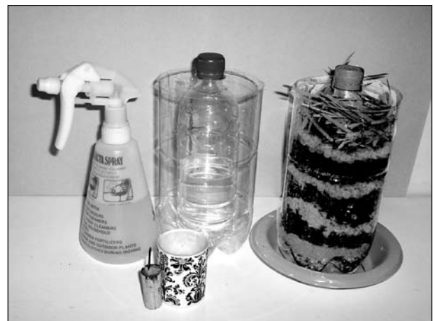
Completed earthworm viewer