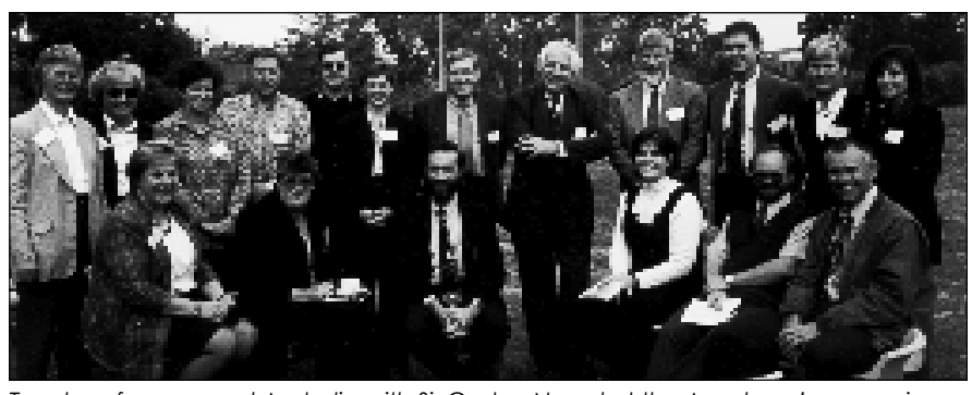
Teachers from around Australia with Sir Gustav Nossal at the Academy's symposium.

Twenty-one science teachers from across Australia exchanged views with Australia's leading scientists at the Academy's Annual General Meeting in Canberra on 1 and 2 May 1997.