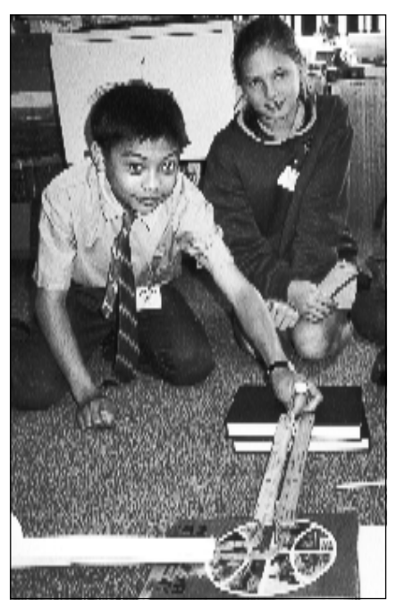
Students from St Thomas the Apostle School, Kambah ACT, participating in the Primary Investigations program, invent a device to guide a marble along an obstacle course and into a container.