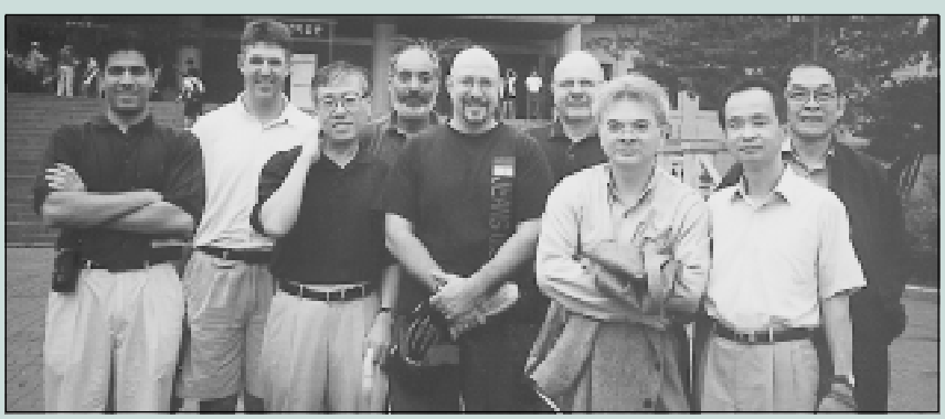
Participants in the Second Korea-Australia Workshop on Rheology.