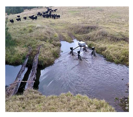
The deployment of technologies such as robotics, autonomous systems and remote sensing is part of a new wave of innovation in agriculture.