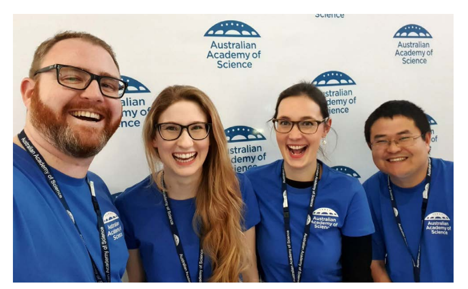
Some of the Lindau Aussies who presented their science to almost 2000 people at Questacon

fresh from mentorship with Nobel prize-winners in Germany<sup>7</sup>.