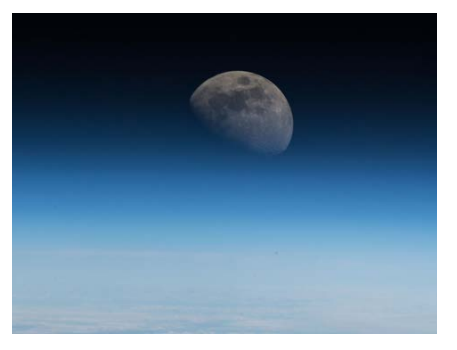
New initiatives will support NASA's mission to return to the moon and travel to Mars.

For more information visit the SAGE website<sup>4</sup>.