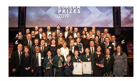
Seventeen Eureka Prizes were awarded this year

The finalists and winners for the awards demonstrated the diversity of the STEM sector and the toplevel science that is coming