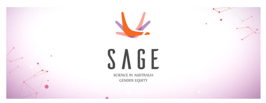
Thirteen Australian institutions have been recognised for their work to eliminate gender bias.