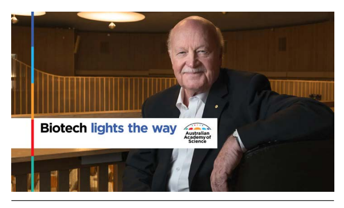
View this article online <sup>32</sup> to watch 'Biotech lights the way'

The Fellowship of the Royal Society are the most eminent scientists, engineers and technologists from or living and working in the UK and the Commonwealth. Each year up to 52 Fellows and up to 10 Foreign Members are elected from a group of about 700 candidates.