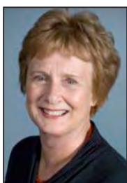
Professor Suzanne Cory AC PresAA FRS President Australian Academy of Science

We hope that the discussions are productive and enjoyable and that our Chinese visitors enjoy the environment in which the Symposium is being held.