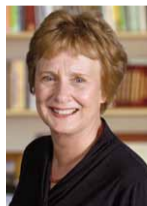
Professor Suzanne Cory AC PresAA FRS President Australian Academy of Science

The Academy is very appreciative of the contributions made to this report by the members of the Expert Group. The Academy also thanks the Defence Science and Technology Organisation for providing financial support to prepare this document.