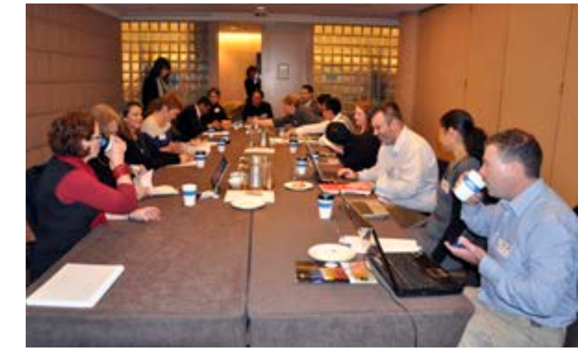
Group work in Group C during the Think Tank

Think Tanks are one of the premier events of the Academy's calendar. The 2012 Think Tank is the eleventh that the Academy has held since 2002.