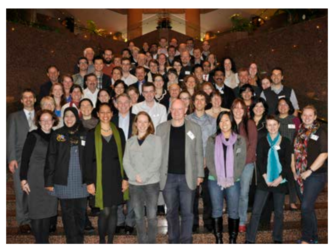
Think Tank 2012 participants and steering committee in Adelaide