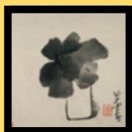
The flower icon used in this program was inspired by the ink and wash painting Flower in jar by Chinese artist Bada Shanren (1626–1705)