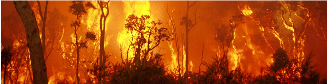
The significant loss of unique Australian biodiversity means the bushfires are unprecedented anywhere in the world.