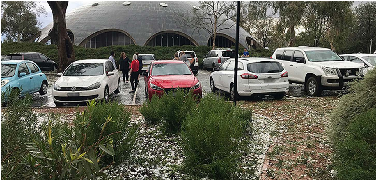
The Shine Dome, Academy staff cars, and Ian Potter House (not in photo) were severely damaged by the hail storm.