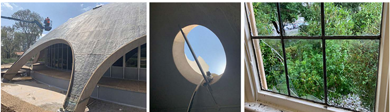
(from left) Large hail caused pitting on the copper roof of the Shine Dome; a broken skylight in the Shine Dome; and one of many broken windows in Ian Potter House.