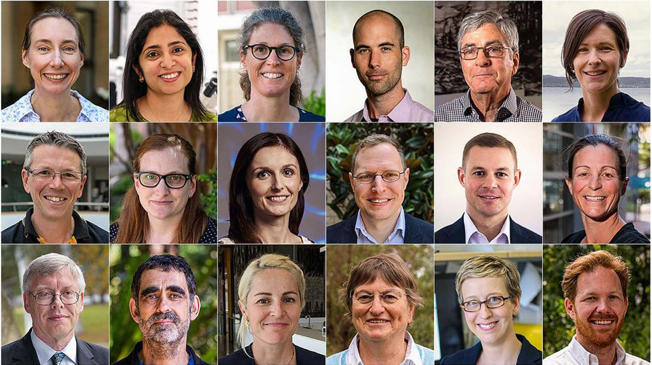
The Australian Academy of Science's 2020 honorific awardees

He's considered one of the leaders in understanding the evolution of early Earth and his techniques have radically reshaped our understanding of Greenland's geology. He also spends time educating the next generation of scientists and said their work has never been more important.