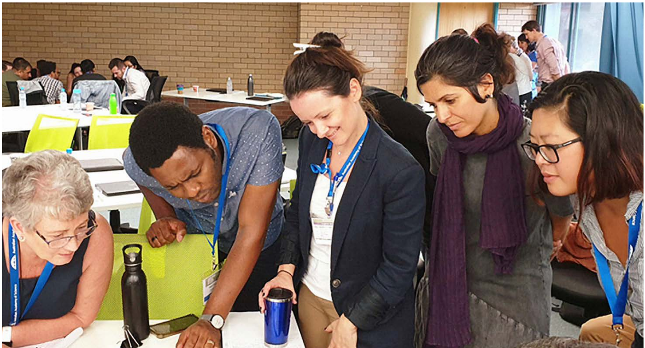
Regional researchers got together in Armidale NSW to build their professional skills. The conference was a Theo Murphy Initiative event and was supported by the University of New England.

The activities to be delivered as part of the new round of the Theo Murphy Initiative will be announced in the coming months.