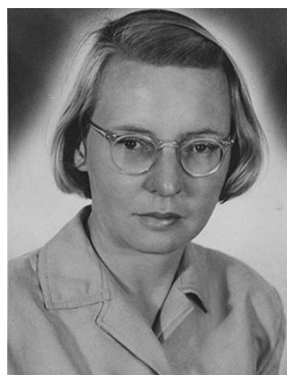
Ruby Payne-Scott (1912–1981) was a pioneer in radiophysics and radio astronomy.

The Ruby Payne-Scott Medal and Lecture for women in science 32 recognises researchers of the highest standing in the physical and/or biological sciences.