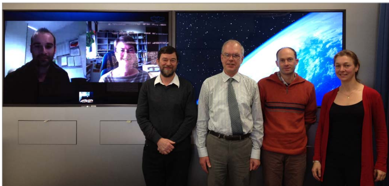
National Committee for Earth Sciences meeting, July 2012