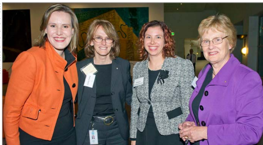
Kelly O'Dwyer, Cathy Foley and Amanda Rishworth with Suzanne Cory at the Mural Hall, Parliament House