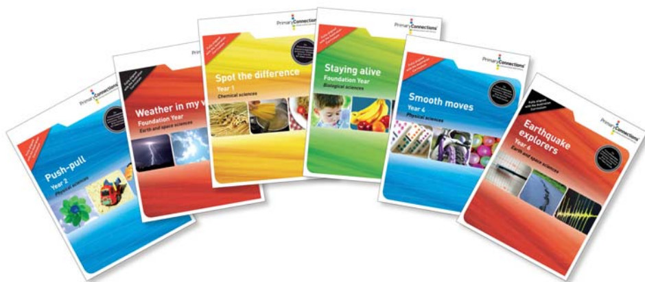
The newly released Primary Connections units