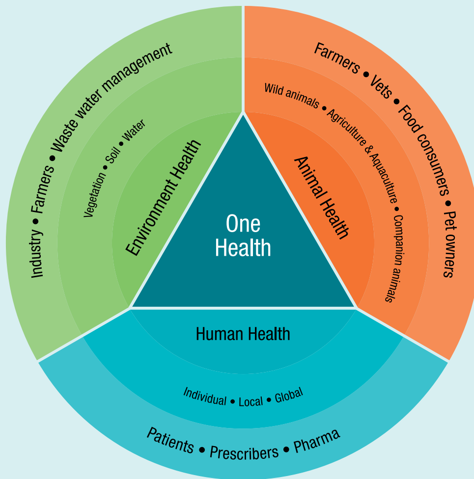
Figure 2: Antimicrobial resistance is a One Health problem with multiple drivers. Diverse stakeholders exert influence over antimicrobial use in the One Health context

required rate. For some stakeholders, this is due to a lack of awareness but for others, barriers that dissuade behavioural change such as social expectations, complacency or economic disincentives play an important role. Identification of these barriers, as well as facilitators of behavioural change, is necessary to guide policy and regulation. Importantly such initiatives must be married with clear communication with all stakeholders in the One Health framework such that the role of stakeholders in the problem and its solutions are clear and that a consistent and coordinated response is elicited.