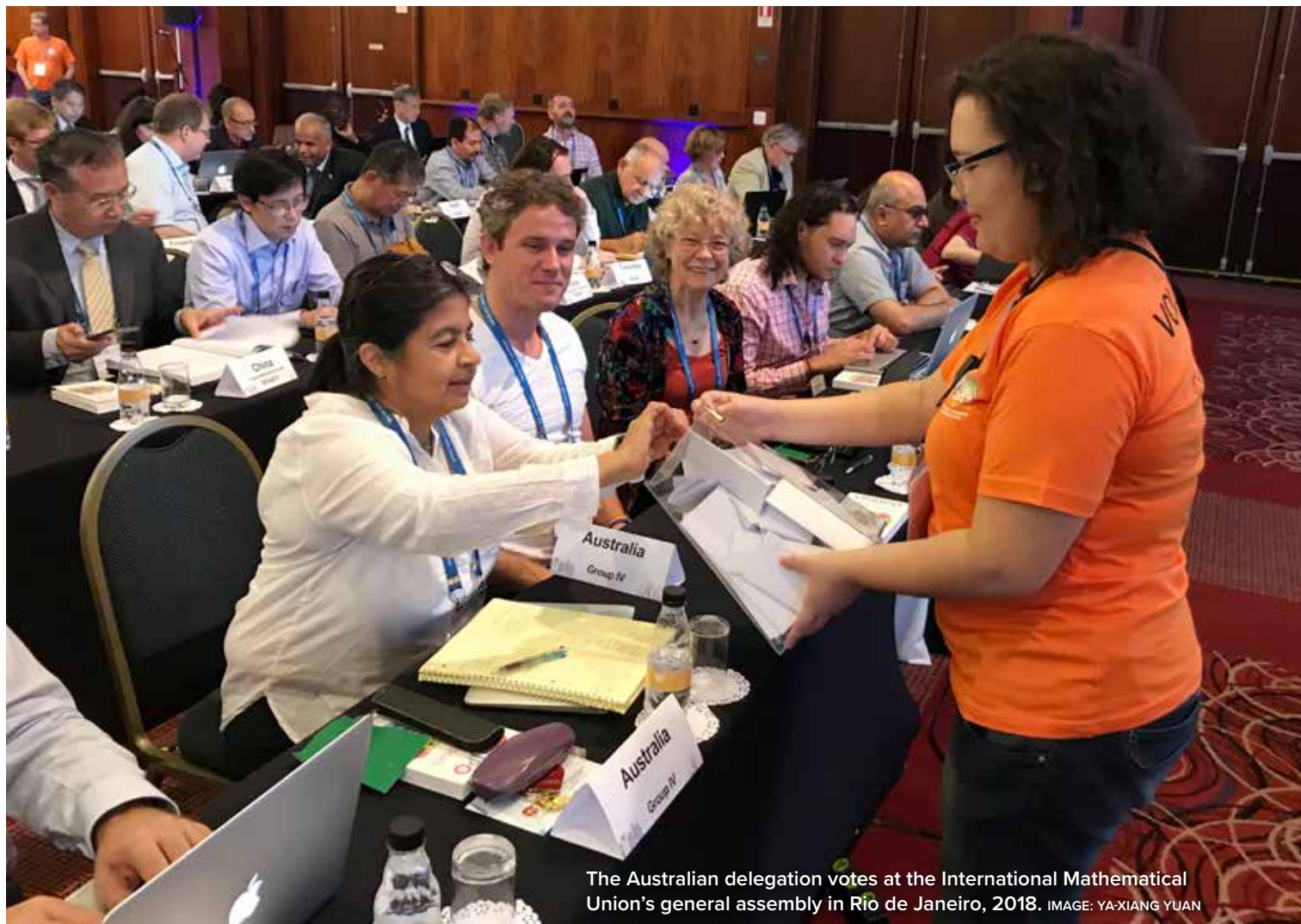
The Australian delegation votes at the International Mathematical Union's general assembly in Rio de Janeiro, 2018.

‘... scientific expertise should be a fundamental part of diplomatic efforts. As single nations can neither solve them alone nor develop solutions to every problem, scientific cooperation becomes an increasing necessity.’