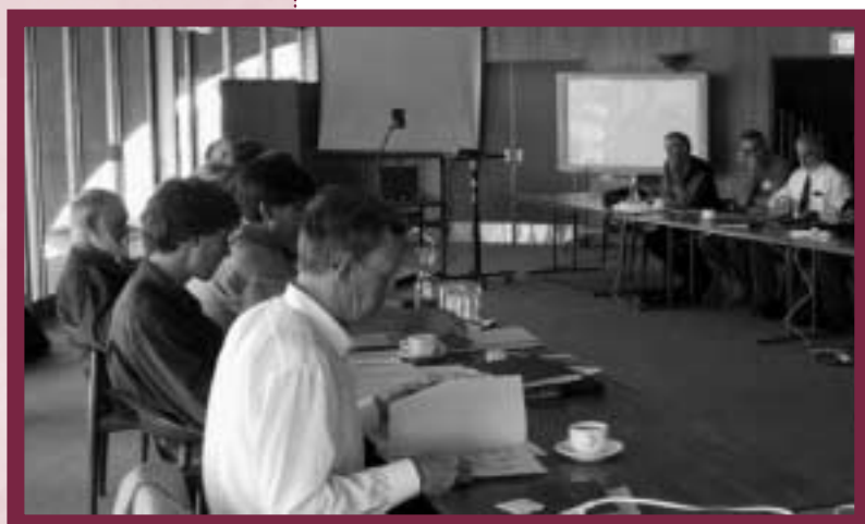
Climate Modelling Workshop, 13-14 February.

In February the committee organised an open meeting to discuss the state of atmospheric and oceanic sciences in Australian universities. It covered issues such as trends in student and staff numbers and grant funding, and what could be done to foster collaboration between relevant groups.