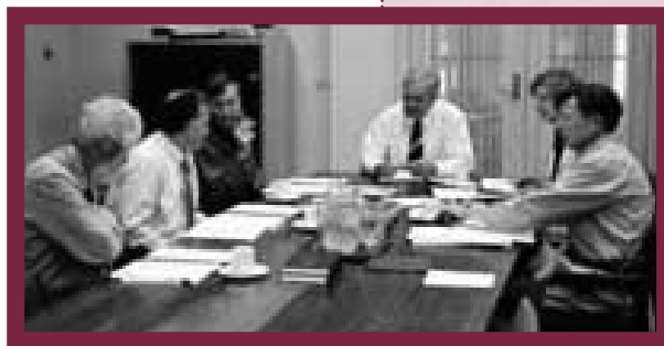
A meeting of the Executive Committee

Council members are listed on the inside front cover of this report.