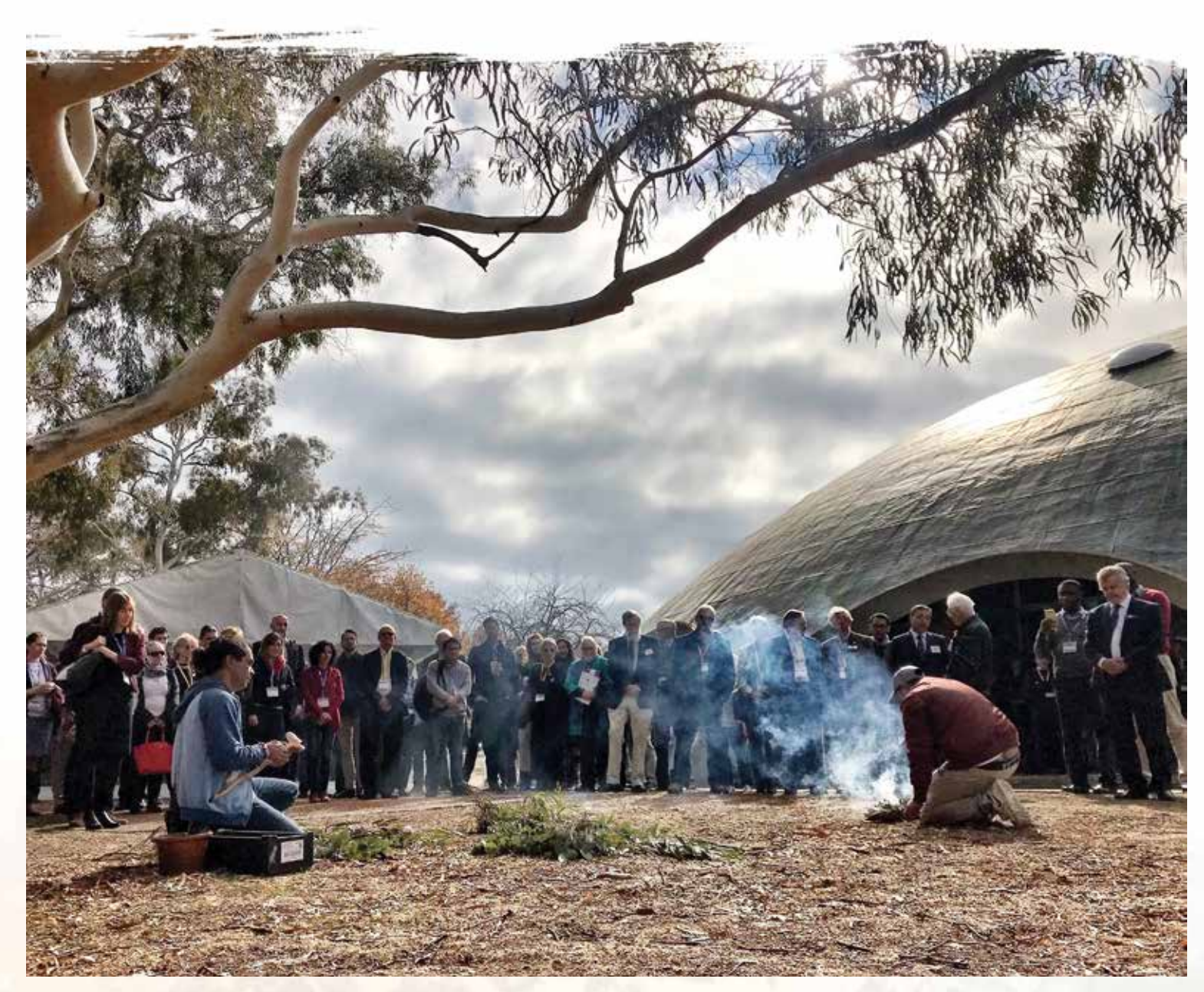
Smoking Ceremony at Science at the Shine Dome 2018