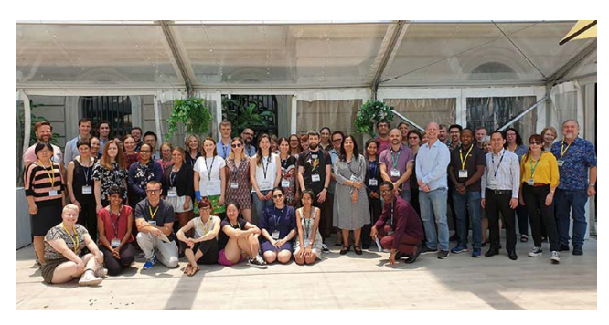
EMCRs at the Theo Murphy Initiative workshop explored how to address reproducibility in science.