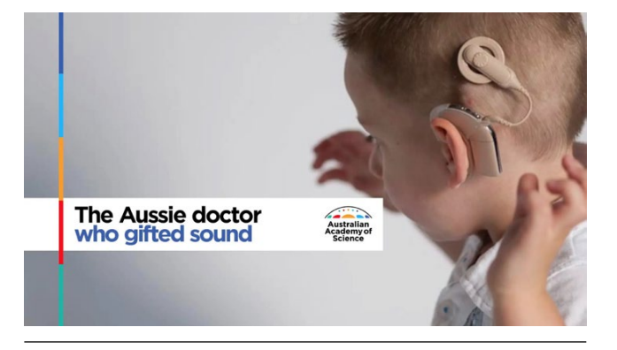
Watch on Vimeo<sup>35</sup>

www.science.org.au/curious/video/aussiedoctor-who-gifted-sound