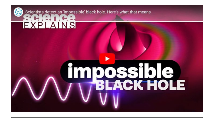
Watch on YouTube<sup>38</sup>