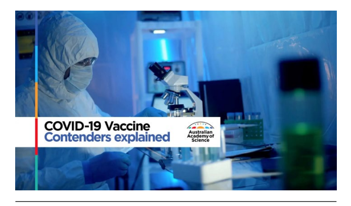
Watch on Vimeo<sup>34</sup>