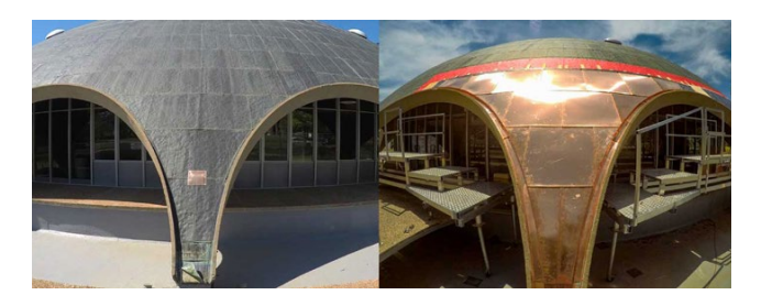
The Shine Dome is being restored, beginning with the curves of the arches.

The home of Australian science, the Shine Dome, will sport a shiny new top and be far more energy efficient as works begin to repair the damage from January's hailstorm <sup>27</sup> which severely dented the Dome's copper roof tiles.