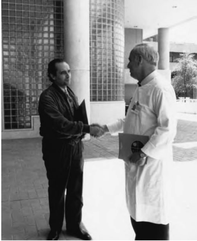
Figure 6. Spanish opera singer Señor José Carreras was an early recipient of colony stimulating factors as part of his treatment for leukaemia, and in 1991 visited Professor Metcalf at the Walter and Eliza Hall Institute.

Morstyn and Richard Fox again oversaw these trials at the Royal Melbourne Hospital. 25 As for GM-CSF they observed a rapid decrease of blood granulocytes immediately following G-CSF injection, which was followed by an even more dramatic and sustained increase in blood neutrophils than seen with GM-CSF. These early studies showed that G-CSF abrogated or reduced the period of neutropenia following single agent or combination chemotherapy for cancer resulting in fewer days on antibiotics or days in hospital and also allowed dose escalation of the chemotherapy in some cases to attempt to eradicate the tumour.