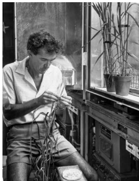
Figure 4. Wheat emasculation.

The crucial test for crop physiology is whether its insights relate to plant breeding and agronomic practice. Along with John Bingham and Roger Austin at The Plant Breeding Institute,