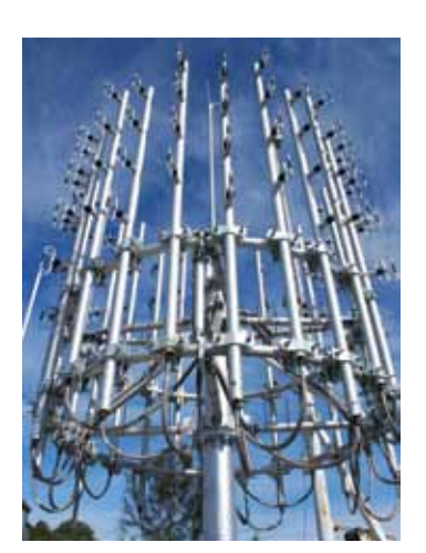
Ngara technology - Access Stage 2 Antenna Array.

SIEF recognises that the objective of science is to benefit the community in which it is undertaken. SIEF's purpose is therefore to fund science that assists Australian industry, furthers the interests of the Australian community or contributes to the achievement of Australian national objectives. SIEF funds projects and initiatives that bring together organisations capable of working together on solutions to these national challenges, connecting science to its community.