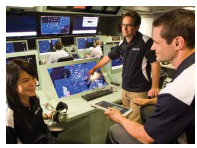
The ANZAC Combat System Integration Laboratory (ACSIL) used for modelling and simulation at the Defence Science & Technology Organisation.

DSTO partners with Australian industry and the science and technology community at home and abroad through strategic alliances and collaborative research projects to deliver national security outcomes.