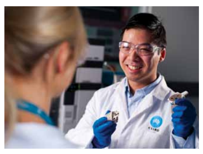
CSIRO's expertise in determining protein structure, and therapeutic design led to the development of Relenza™, the first drug successful in treating the flu

As Australia's largest research organisation, CSIRO is well connected within Australia and around the world. CSIRO works closely with partners from government, higher education and industry to develop and share new research and technology, and provides trusted advice to our partners, to governments and to the general public.