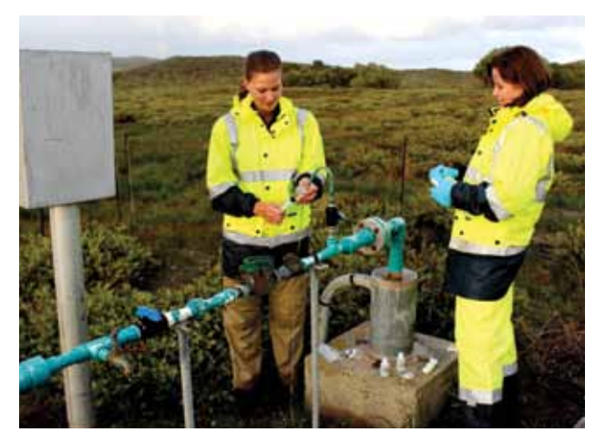
ANSTO researchers conducting groundwater testing at Rottnest Island, WA.

ANSTO recognises that collaboration keeps us connected to the great scientific advancements and optimises opportunities for our scientists. ANSTO has collaborative agreements with several of the world's top science organisations including CERN (the European Organisation for Nuclear Research), Japan's High Energy Accelerator Research Organisation (KEK), the French Atomic Energy Organisation (CEA) and Shanghai Institute for Applied Physics (SINAP).