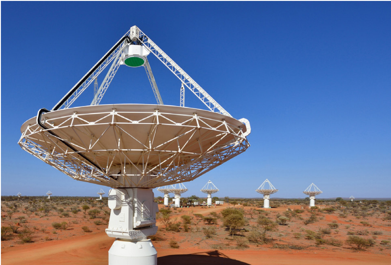
New generations of scientific instruments, such as the Square Kilometre Array, are expected to produce extremely large data streams. Image shows antennas of CSIRO's ASKAP telescope at the Murchison Radio-astronomy observatory in Western Australia.