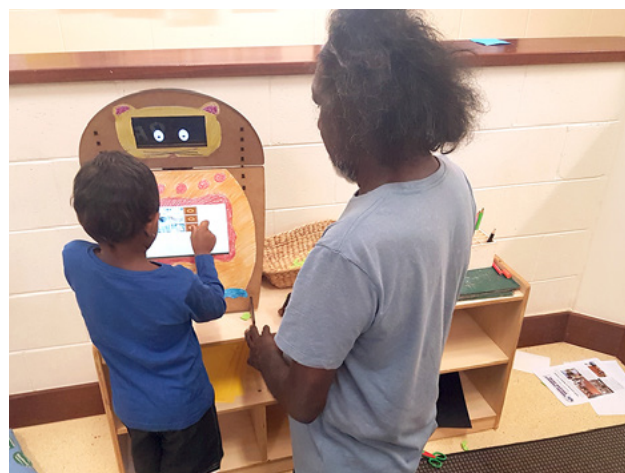
CoEDL researchers aim to build AI language recognition software into their robot, Opie, designed to teach children to understand Australian Indigenous languages. CREDIT:

The greatest challenges are poor data quality and multi-lingual recordings, dialects and accents, small training corpuses and privacy or access restrictions. Indigenous communities can be reluctant for their recordings to be stored or processed on the cloud due to security, privacy and confidentiality concerns. Despite these challenges, to date, these advances have enabled linguists to train models and obtain usable first-pass transcriptions of data for 16 endangered languages across the Asia-Pacific region. 34 The long-term ambition of the project is to build the AI language recognition software into CoEDL’s robot, Opie, designed to teach children to understand Australian Indigenous languages.